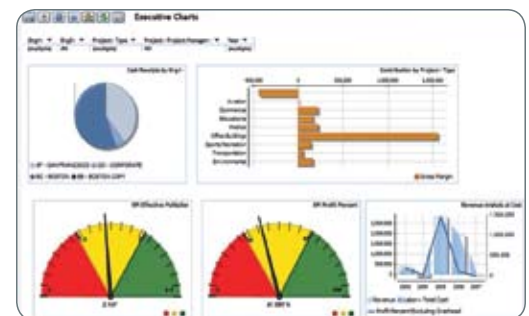
Fig. 2: The pre-configured Executive role-based dashboard provides data about the overall financial health of your business.