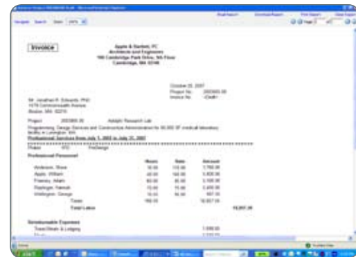
Figure 2: Vision Billing helps you prepare timely and accurate invoices so you can get paid more quickly

Universal access and zero-client install ensure that any user with Internet Explorer can access the system from anywhere at anytime. Other than a web browser, no plug-ins or applets are needed. Vision supports hundreds of concurrent users, yet can be readily scaled down to meet the requirements and resources of smaller organizations.