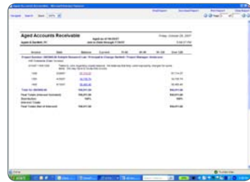
Figure 4: Vision's Aging reports and Aging Alerts keep you on top of outstanding invoices so you can improve cash flow